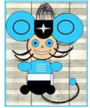
Mouse compliments of our very own McDuff circa: 1971